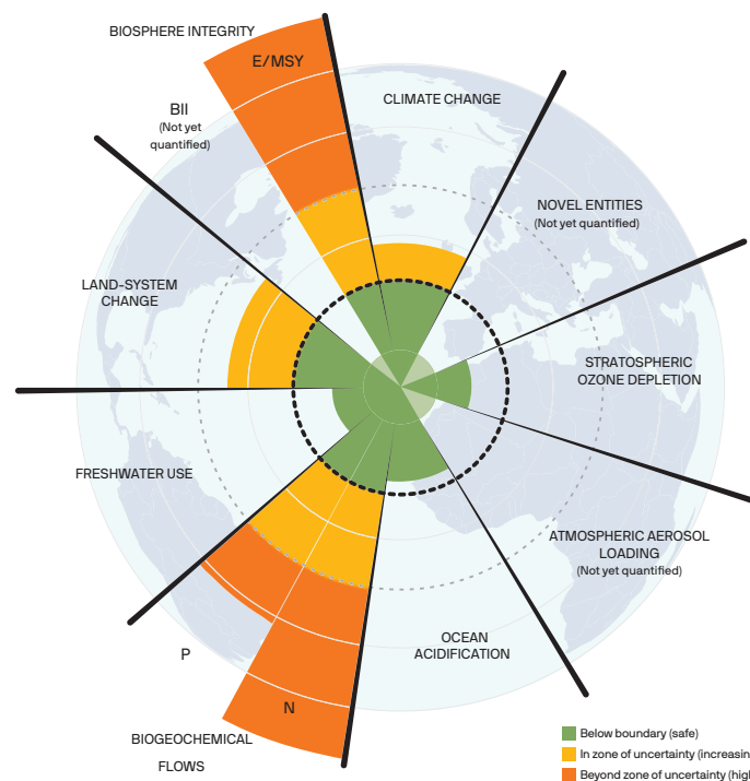
Exhibit 1: The planetary boundaries framework 5